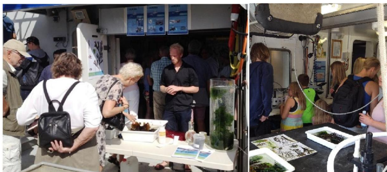
Figure 2 'MacroFuels' at the Open Harbor Day at Aarhus University