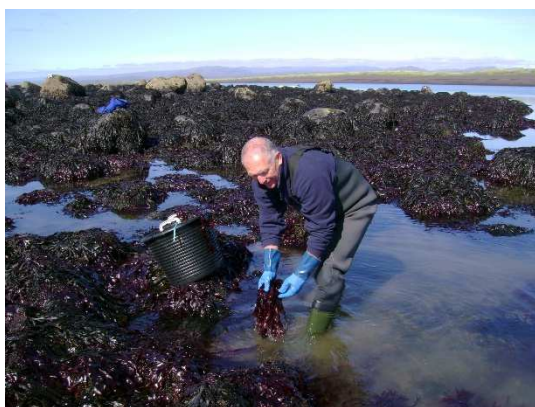
Manual wild seaweed harvest in Iceland