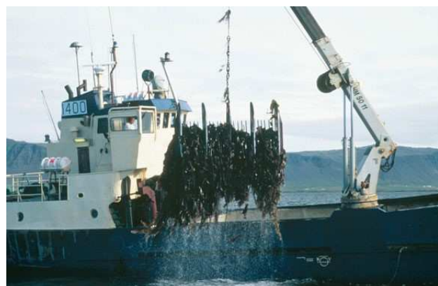
Mechanized wild seaweed harvest using dredge